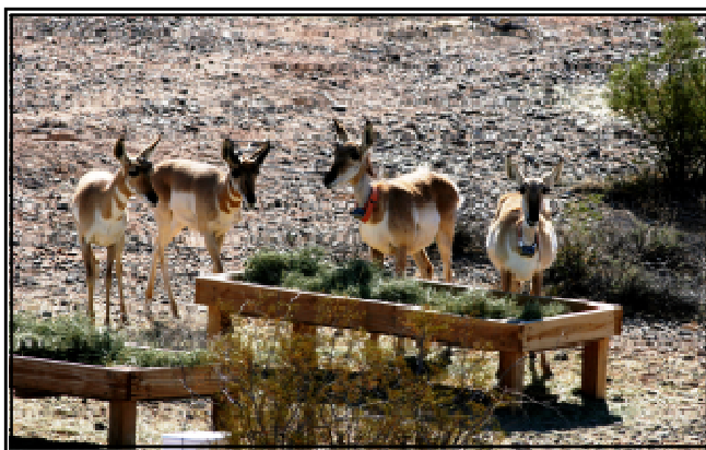
Several pronghorn in the southwest quarter; adult females orange and orange/brown, both pregnant in this photo, and a male and female fawn from last year. Photo by Mike Coffeen, 3/2/07.

Conditions over most of the range are very dry, although there are some areas that are markedly better than others. The area that burned on South Tac in 2005 is greener than most areas, with large patches of green forage in the washes. This is also where 5 radio collars, and 18 pronghorn were seen on the telemetry flight. Some parts of the Mohawk Valley, and some areas around the Fawn Hills along the east side of the Sierra Pinta mountains are also fairly green. This is the area where the dead buck was found.